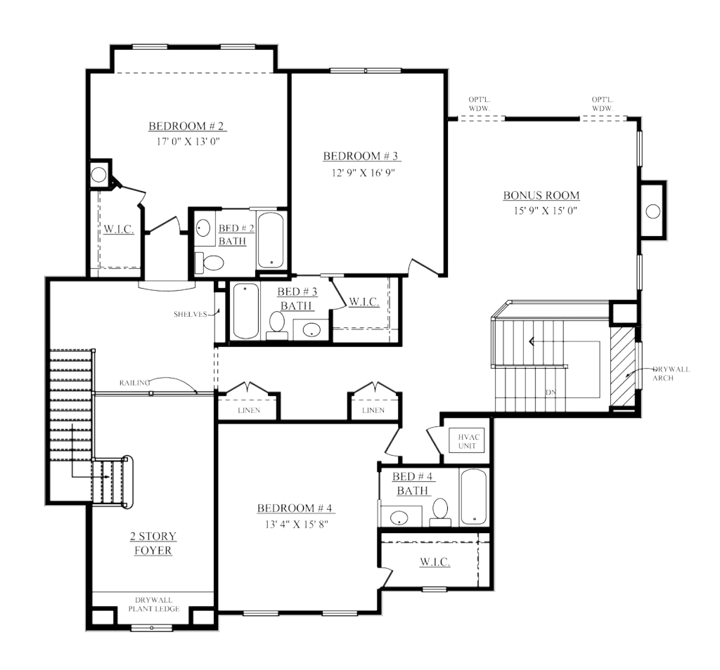
Optional Second Floor with Foyer Stair

Estate Portfolio 4 Bedrooms | 4-1/2 Baths | 4,447 sq. ft