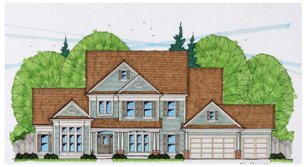
Arts & Crafts